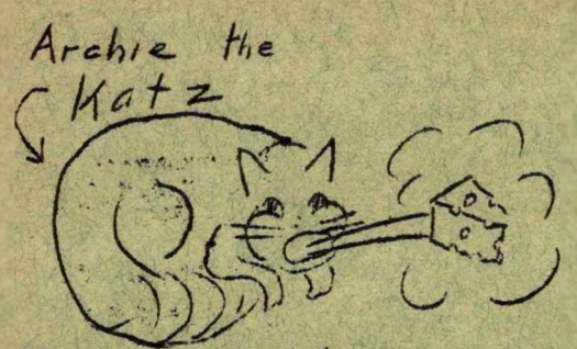
"I, too, await it's coming with baited breath." MEOW 5